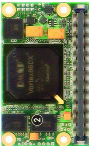
Real scale size

Fastwel CPB906 supports DOS, Windows CE 5.0, Linux 2.6 and QNX 6.3 operating systems.